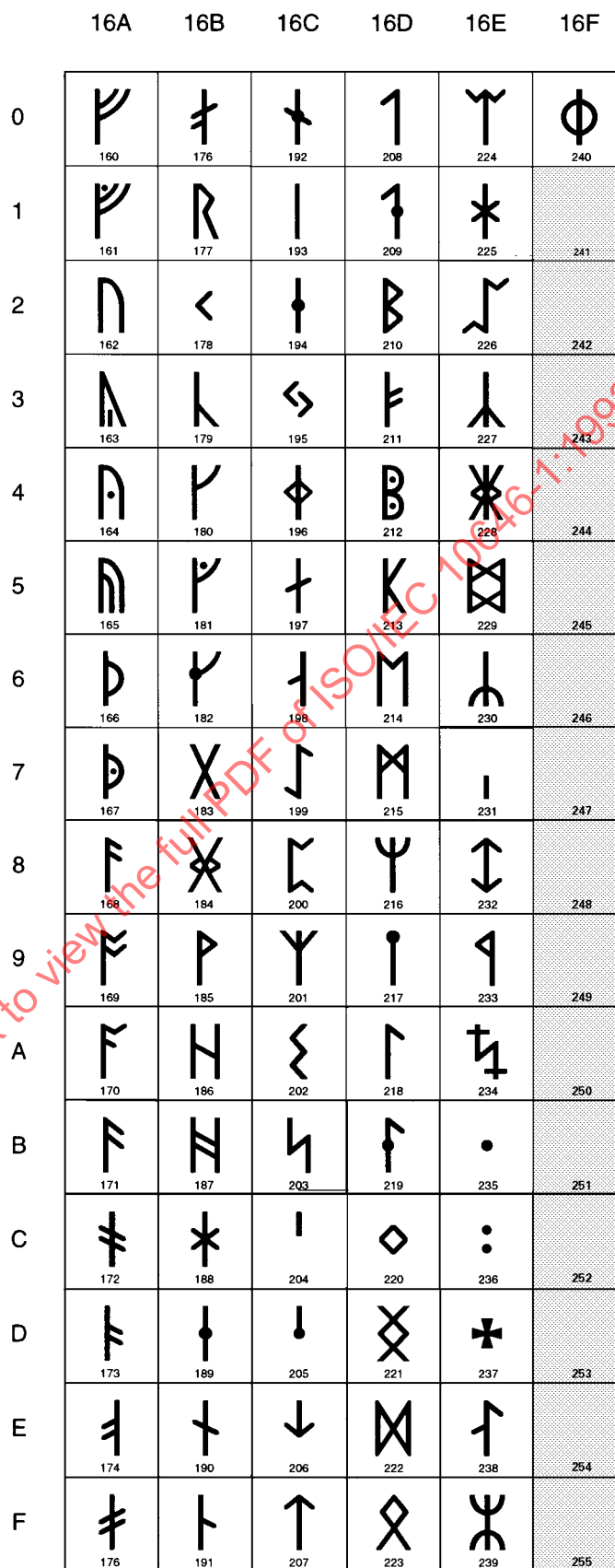
TABLE 236 - Row 16: RUNIC